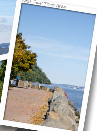
Ross Dock Picnic Area