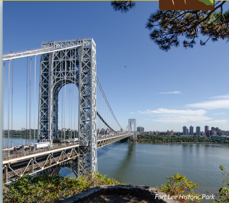
Fort Lee Historic Park

Enjoy indescribable outdoor adventure, treat your family to the beauty and rich history of the Hudson River, breathe in the one-of-a-kind views of the New York City skyline and learn the area's enduring history...all in our picturesque surroundings.